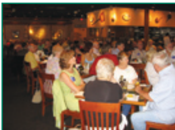
150 Guests at Candidate Endorsement Luncheon