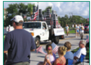
IRNA Parade Marchers. Approximately 5,000 People Attended.