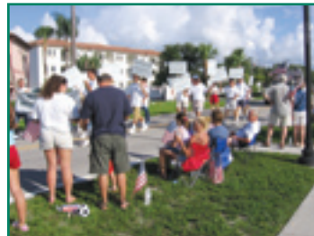
IRNA 4th of July Parade. Our Theme "Lets not look like South Florida"